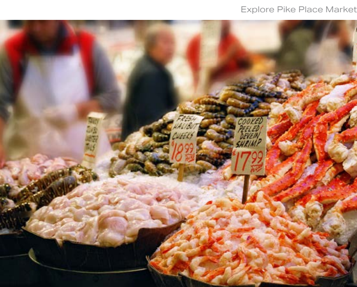
Explore Pike Place Market