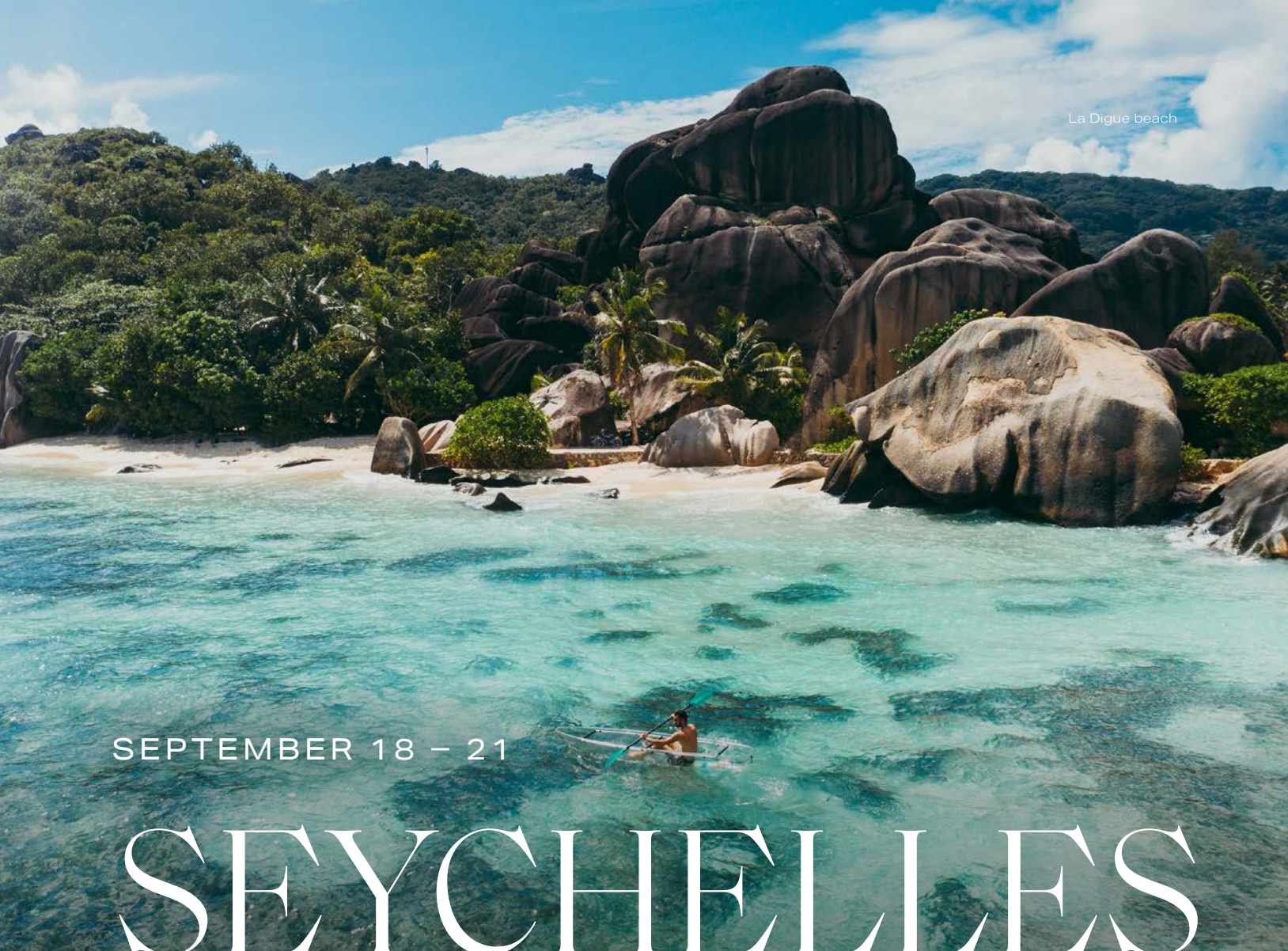
La Digue beach