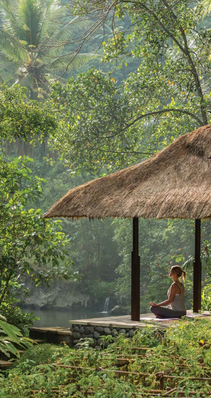
Meditation by the Ayung River