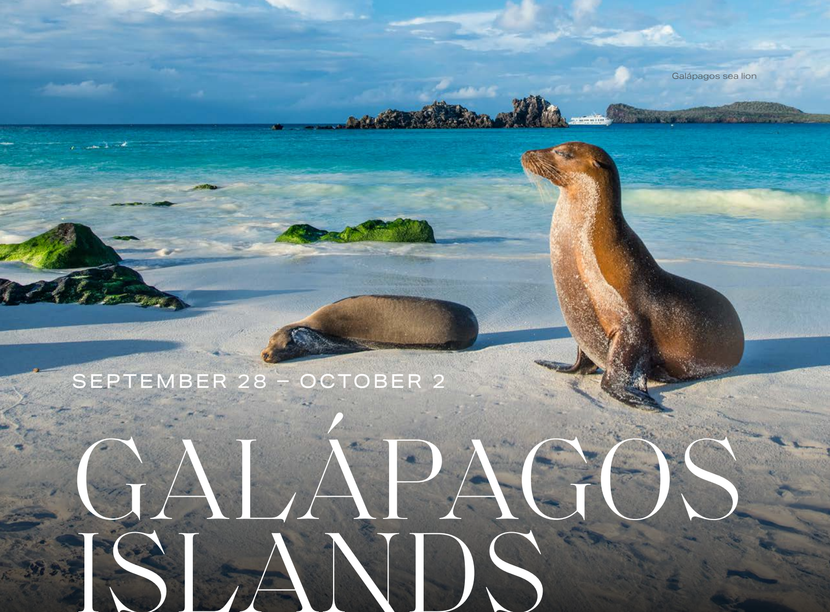
Galápagos sea lion