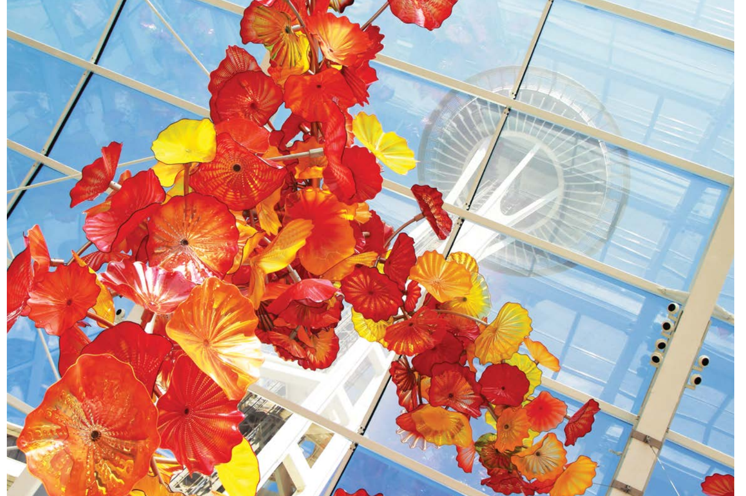
View of the Space Needle from Chihuly Garden and Glass

Go behind the scenes at Seattle's most famous attraction on a food and cultural tour of the Pike Place Market with a local chef as your guide. Enjoy one-on-one time with merchants before they open for the day and sample small bites from local vendors.