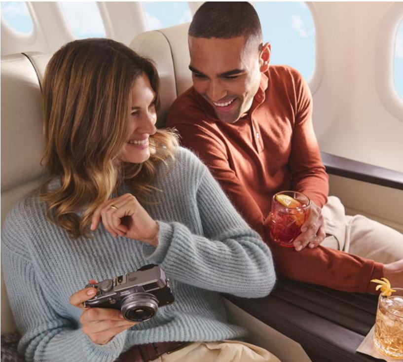
Enjoying in-flight cocktails

With one of the widest and tallest cabin in its class, the fully customised Four Seasons Airbus A321 offers more room to socialise, dine and relax at your leisure. The lounge area offers dedicated space to move freely about the cabin and strike up conversation with other guests. Here you will also enjoy opportunities to sample a rotating selection of food and beverages inspired by your next destination.