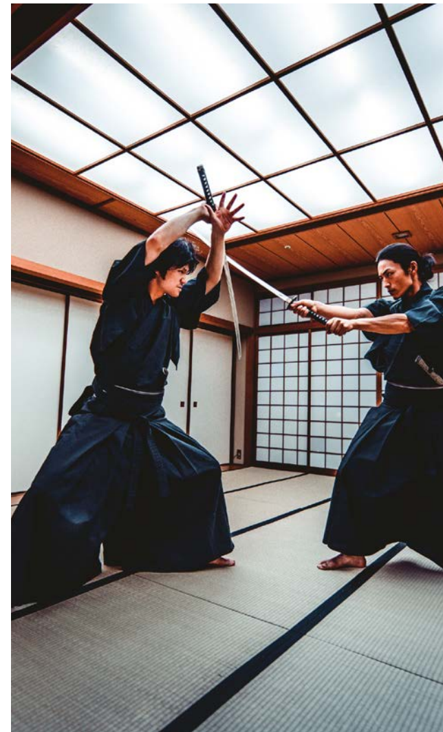
Samurai sword demonstration

Embark on a tour of the city's spiritual landmarks, beginning with the Fushimi Inari Shrine, famous for the thousands of vermillion torii gates that form a path up to the mountain behind it. Explore the beautifully preserved architecture of the Gion district, home to the Kenninji temple, the oldest Zen temple in Kyoto.