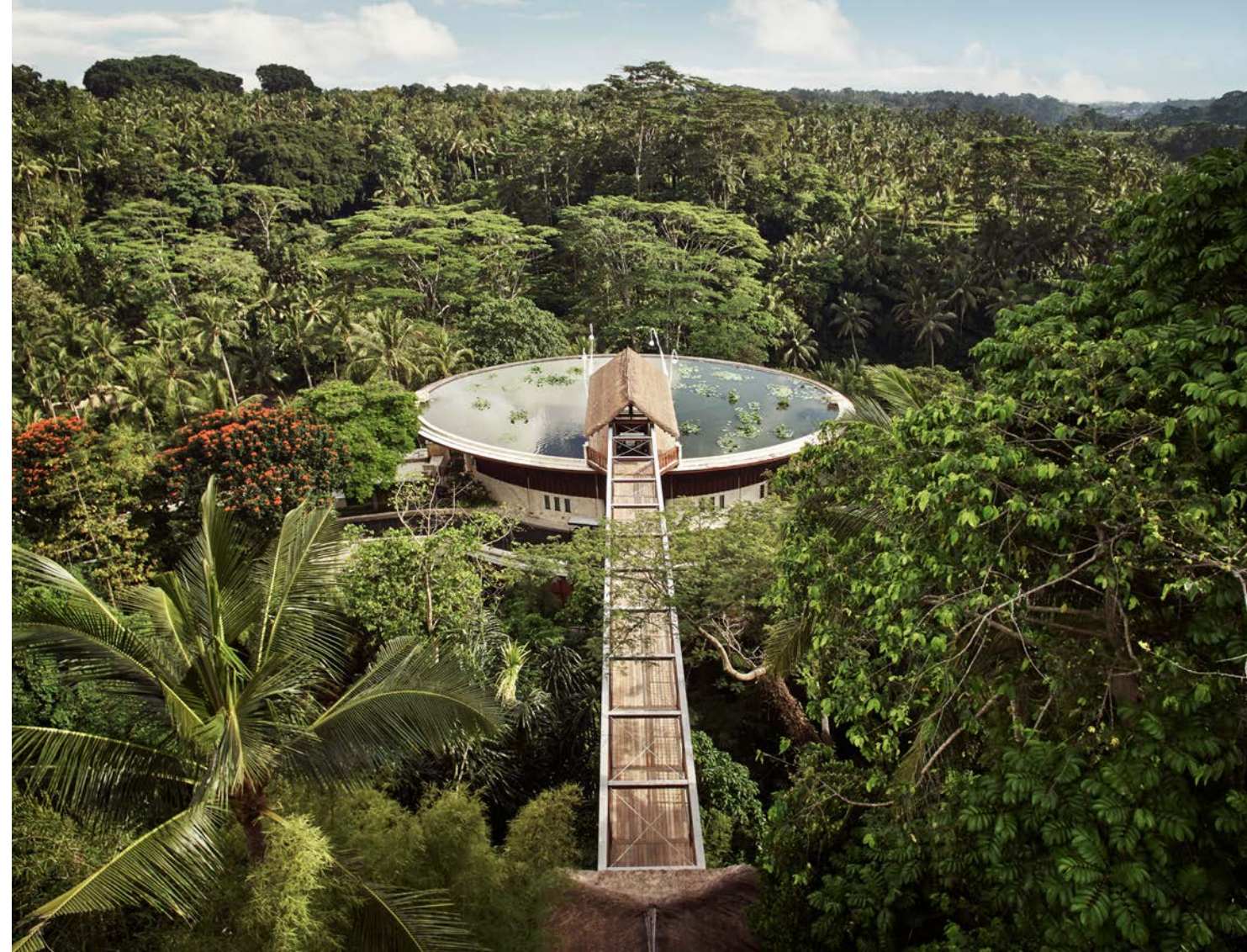
Lotus pond, Four Seasons Resort Bali at Sayan

Experience the power and beauty of the Ayung River while rafting on its Class 2 rapids through vine-hung gorges studded with cascading waterfalls.