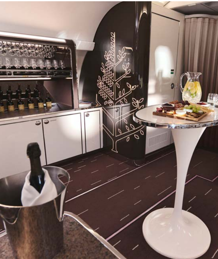
Savour snacks and beverages in the Lounge in the Sky