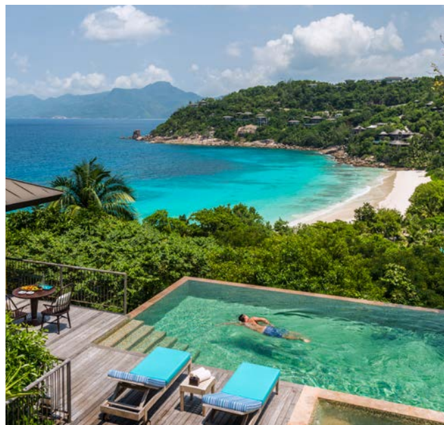
Private infinity-edge pool, Four Seasons Resort Seychelles

In the spectacular Seychelles, uncover secluded white-powder beaches, marvel at dramatic rock formations and take a dip in vivid sapphire waters.