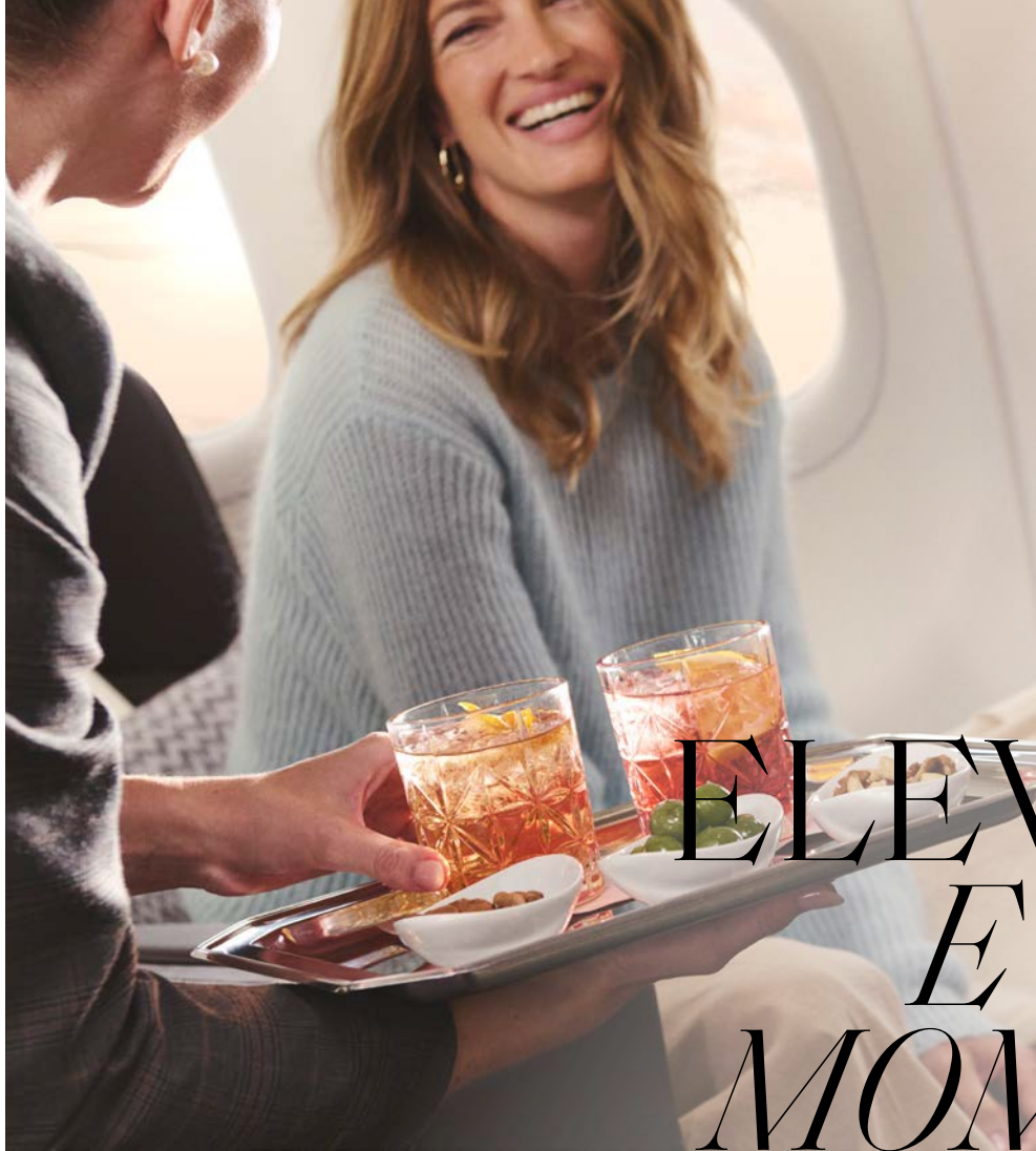
Personalised service from dedicated journey staff