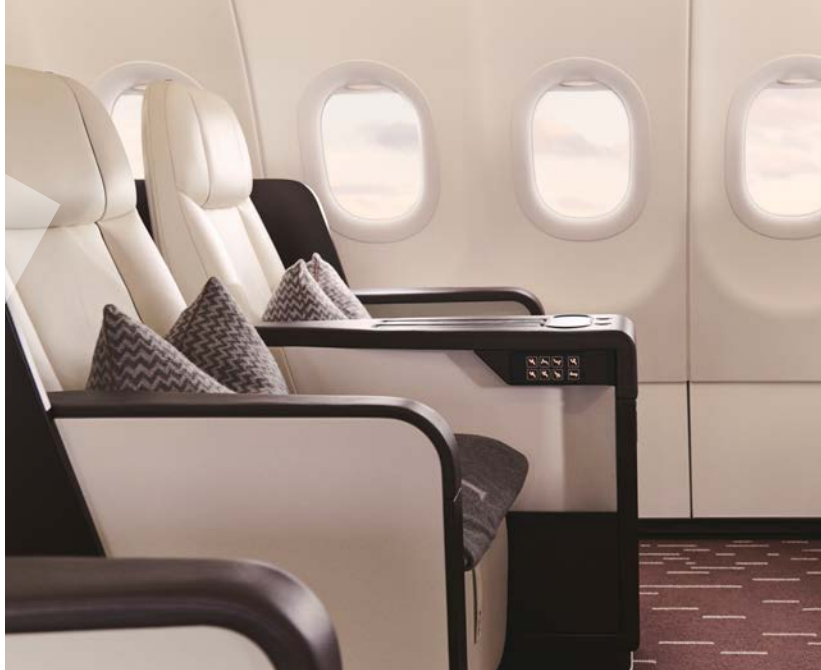
Italian-leather flatbed seats