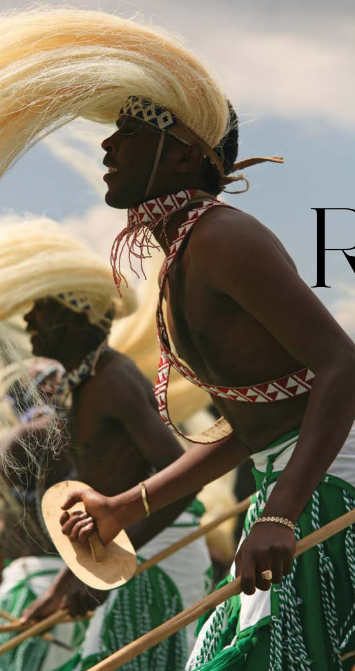
Traditional Intore dance performance