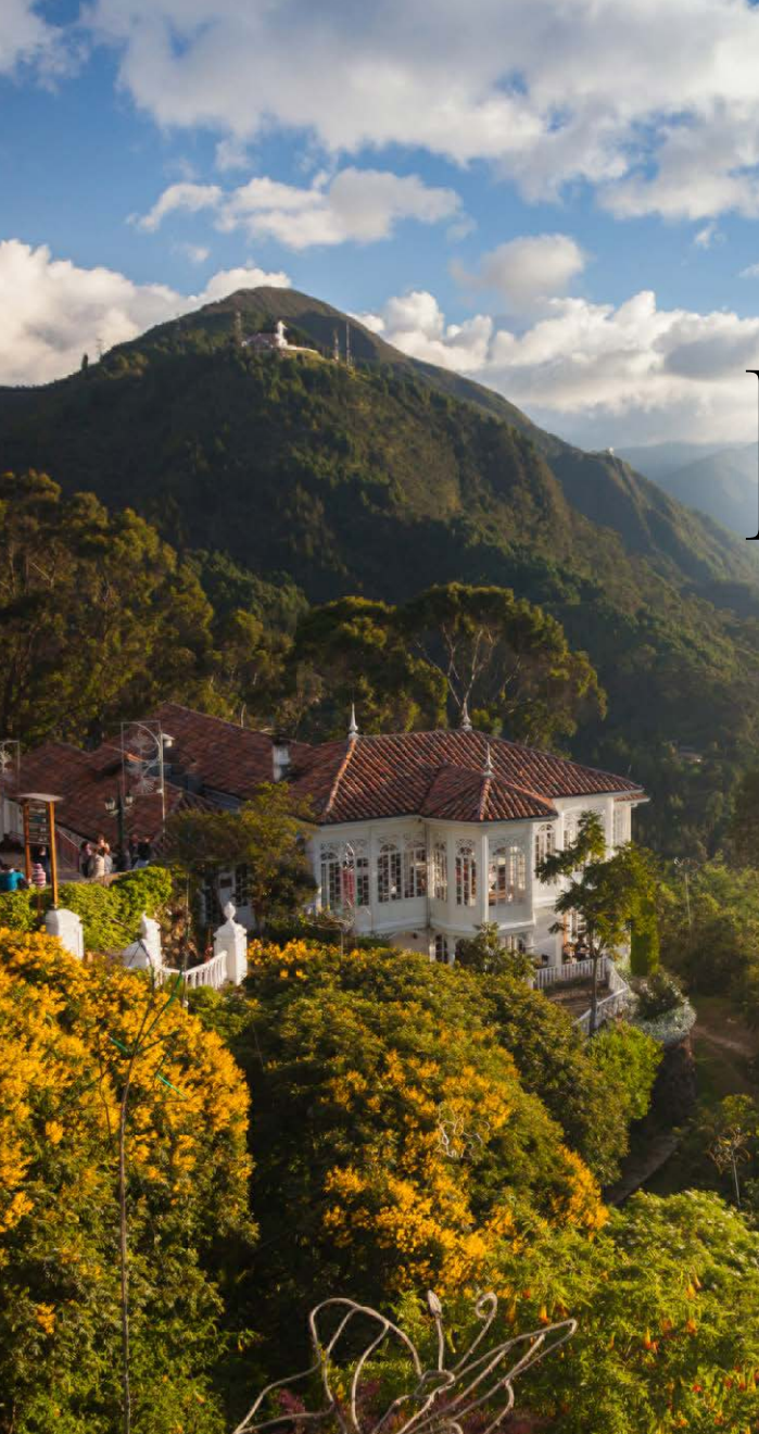
Four Seasons Hotel Casa Medina Bogotá