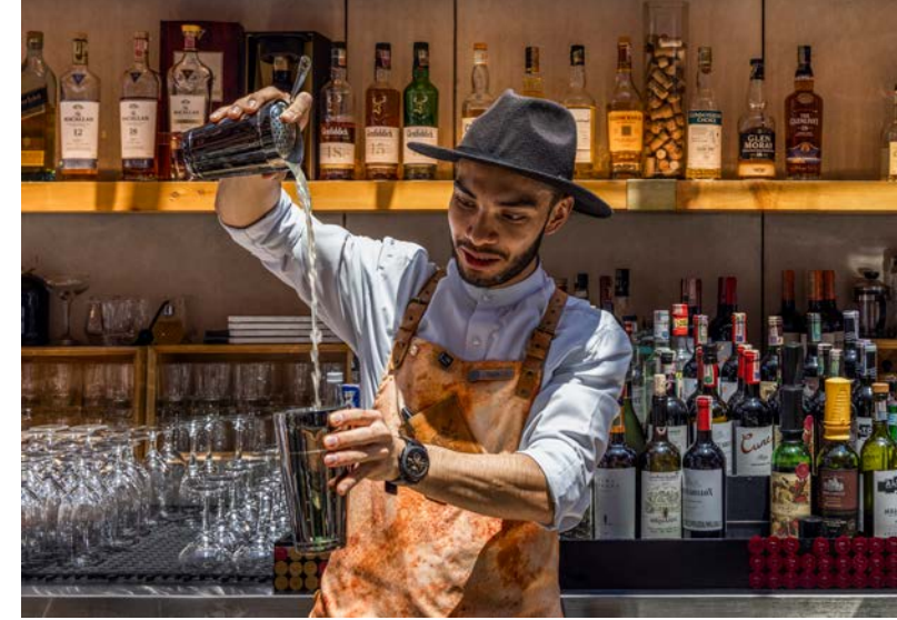
Craft cocktails, Four Seasons Hotel Casa Medina Bogotá