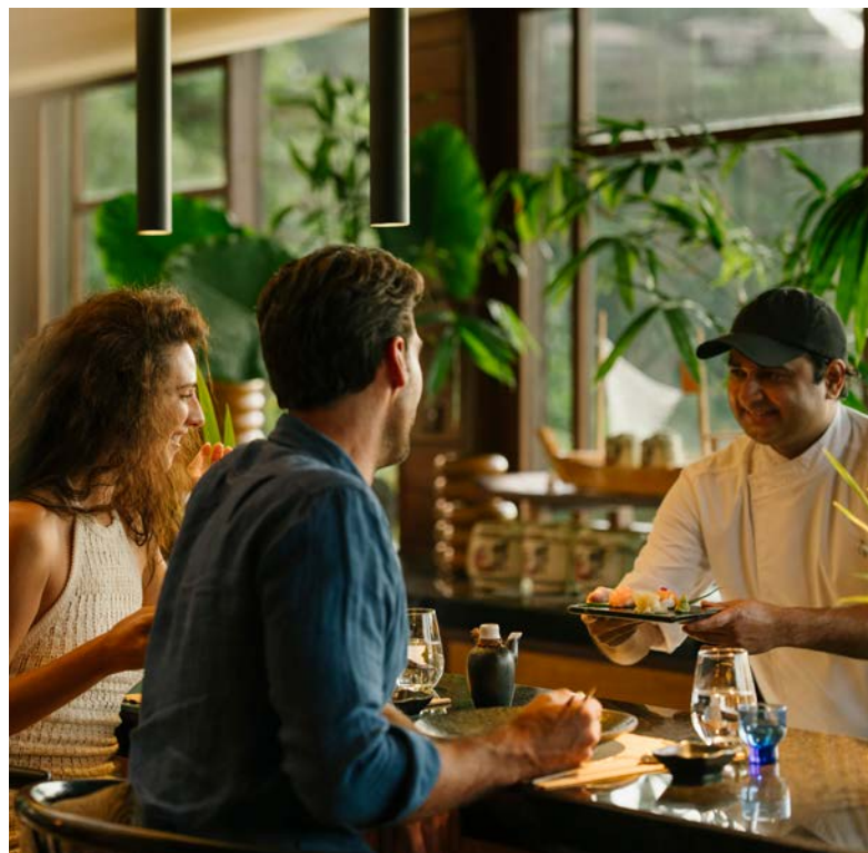
Creole cooking class