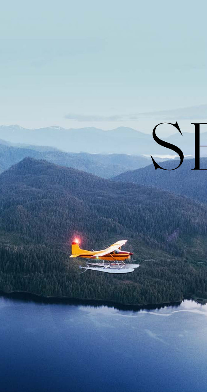
Seaplane tour of Seattle and Puget Sound