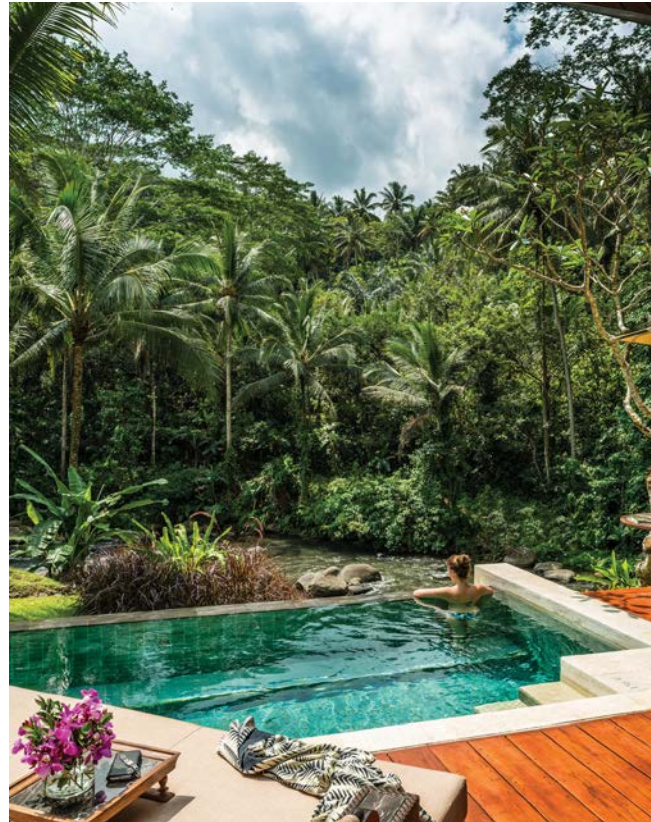
Four Seasons Resort Bali at Sayan