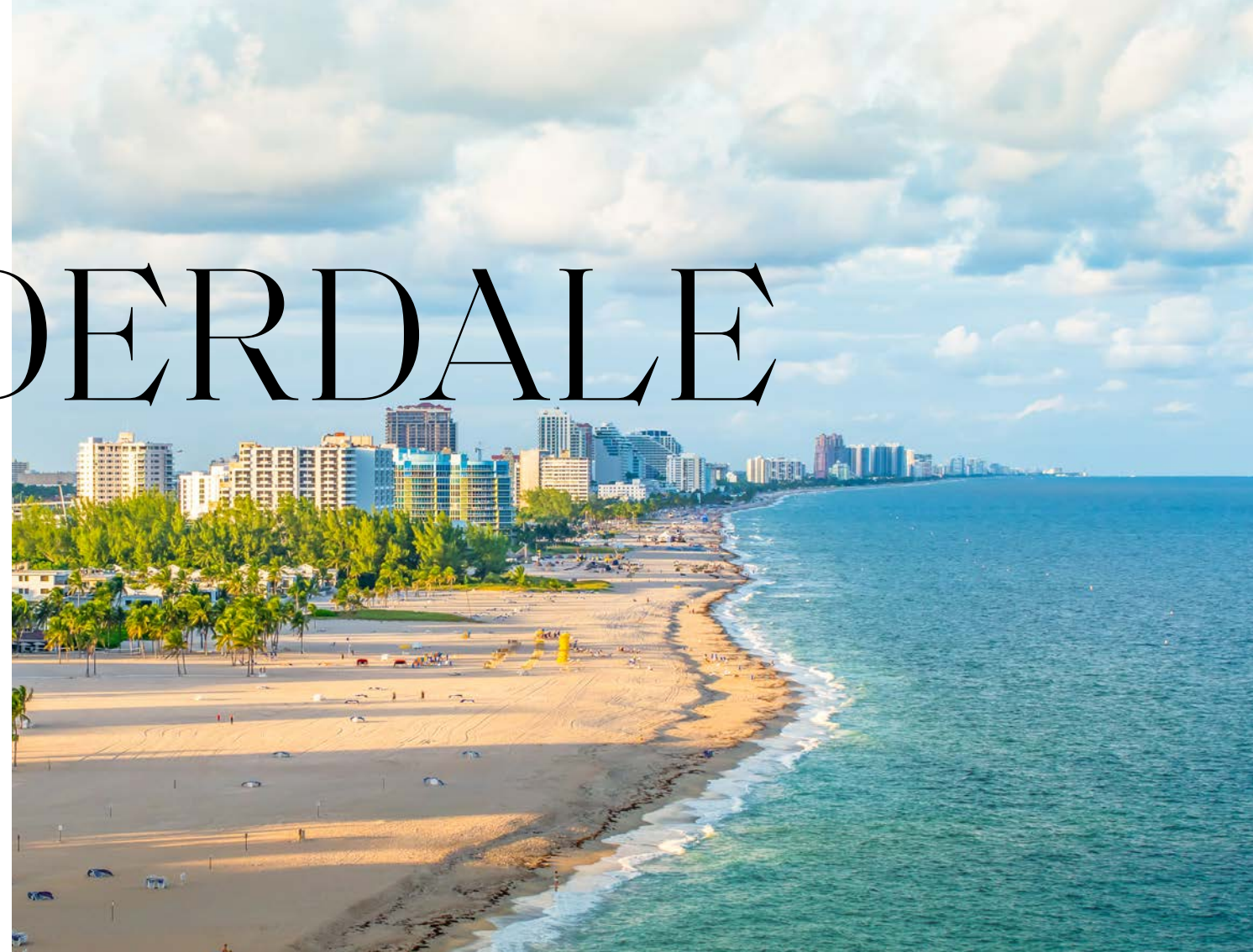
Fort Lauderdale beach

Complete your journey with a celebratory champagne and dessert finale. Make plans to keep in touch with newfound friends as you enjoy the Florida warmth and relaxed glamour of our beachfront hotel. If you choose to stay on a little longer in Fort Lauderdale at the end of your journey, we can curate experiences that will serve as a relaxing bookend to your adventures around the globe.