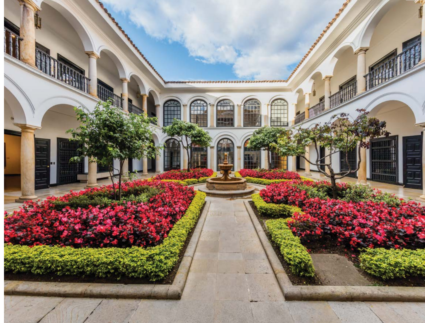
Elegant courtyard of Museo Botero, Bogotá

Gather for brunch in the courtyard of the Museo del Chico, housed in an 18th-century casona (house) surrounded by what was once a sprawling hacienda.