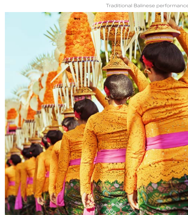
Traditional Balinese performance