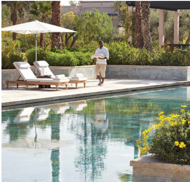
Four Seasons Resort Marrakech pool

Welcome to the fascinating Red City. A visit to Marrakech is a full sensory experience brimming with exotic flavours, bustling markets and expansive, desert-meets-mountain views.