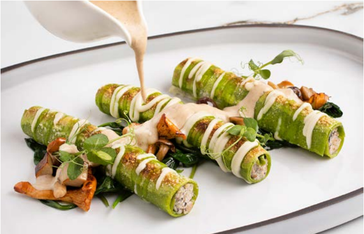
Gourmet in-flight meals

Experience the highest Four Seasons restaurant in the world. During flight, our Executive Chef will create inspiring meals that introduce you to new flavours and intriguing culinary perspectives.