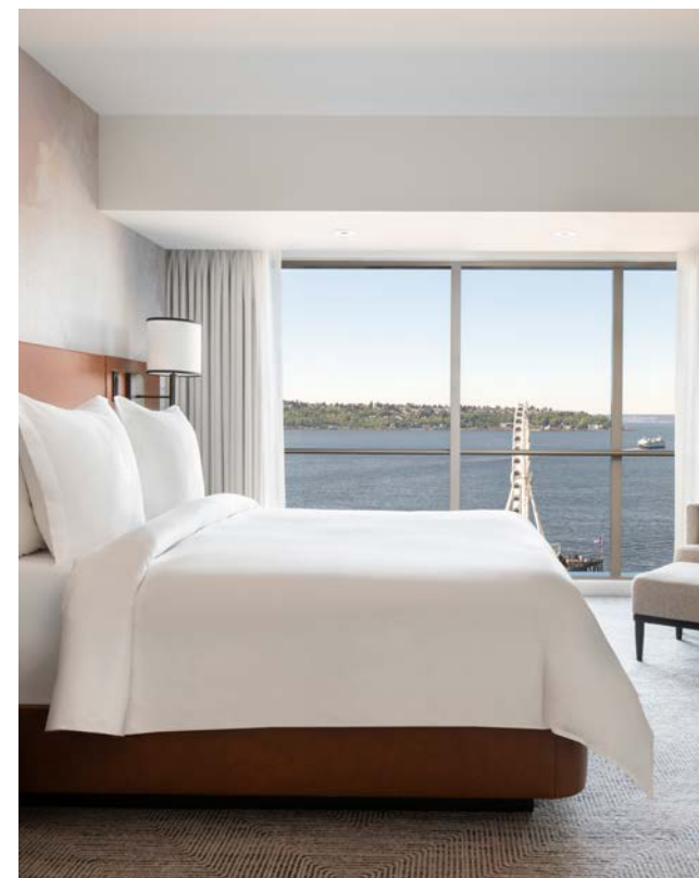
Four Seasons Hotel Seattle