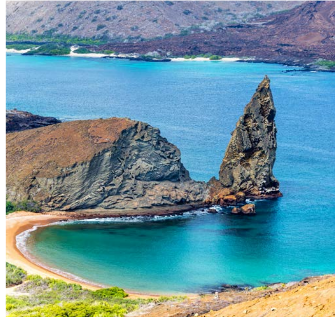
Rocky coastline of the archipelago

Comprising more than 18 islands and dozens of smaller islets sprinkled hundreds of miles off the coast of Ecuador, the Galápagos offers landscapes and wildlife found nowhere else on earth.