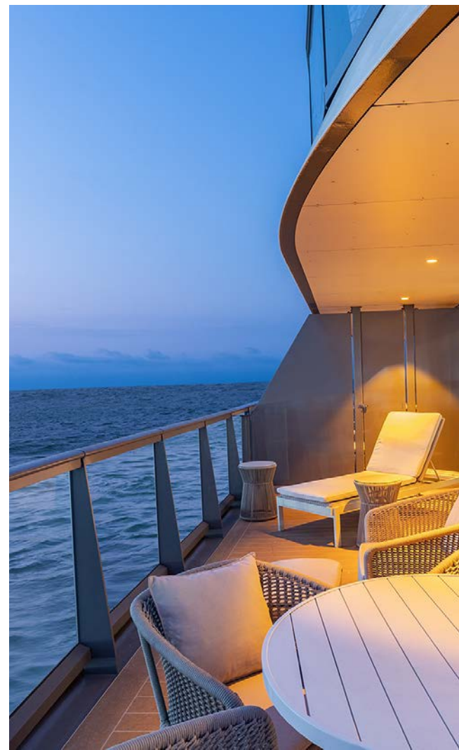
Suite accommodations with balcony views

As you discover the rocky coastlines of the archipelago, look for colonies of marine iguanas sunning themselves on the rocks, while Galápagos sea lions and their pups take shelter on the beach.