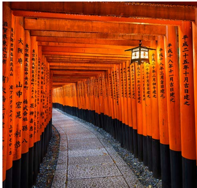
Spectacular torii gates of Fushimi Inari Shrine

Kyoto is the gateway to Old Japan—and Four Seasons is your key to unlocking the centuries-old magic that fills the streets, temples and gardens of the city that emperors once called home.