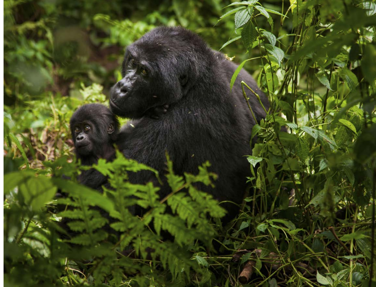
Mountain gorilla family

A unique mix of cottages, bungalows and suites awaits you at Singita Kwitonda Lodge , Sabyinyo Silverback Lodge , Bisate Lodge , Amakoro Songa or Virunga Safari Lodge . Nestled in the foothills of the mighty Virungas, each property has been thoughtfully built using local techniques and design.