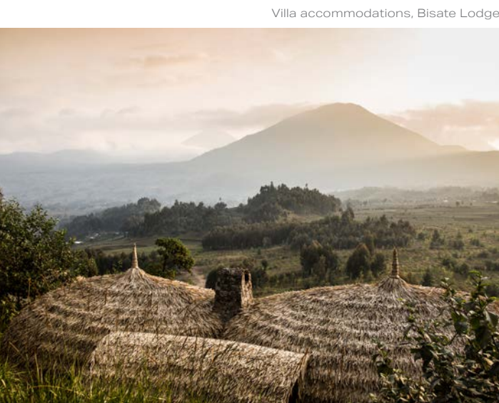
Villa accommodations, Bisate Lodge