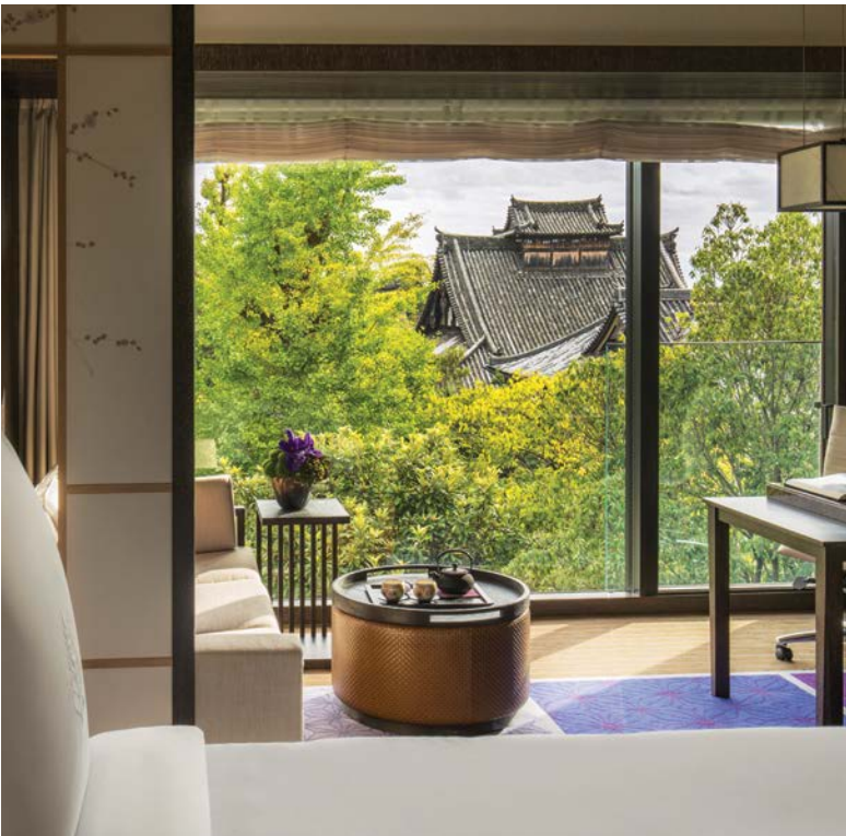
Authentic tea ceremony

Located near historic temples as well as downtown Kyoto, Four Seasons Hotel Kyoto is built around an 800-year-old pond garden that immerses you in the beauty of ancient Japan. Indulge yourself in the blissful Spa, sip freshly brewed matcha in the Tea House, or dine at the Michelin-starred Sushi Wakon.