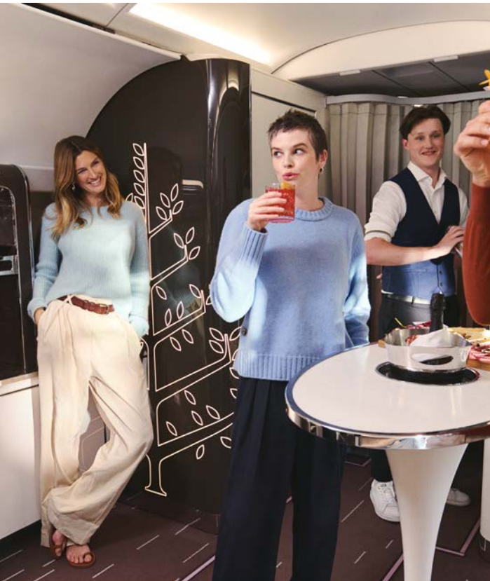
Savour snacks and beverages in the Lounge in the Sky

With one of the widest and tallest cabins in its class, the fully customised Four Seasons Airbus A321 offers more room to socialise, dine and relax at your leisure. The lounge area offers dedicated space to move freely about the cabin and strike up conversation with other guests. Here you will also enjoy opportunities to sample a rotating selection of food and beverages inspired by your next destination.