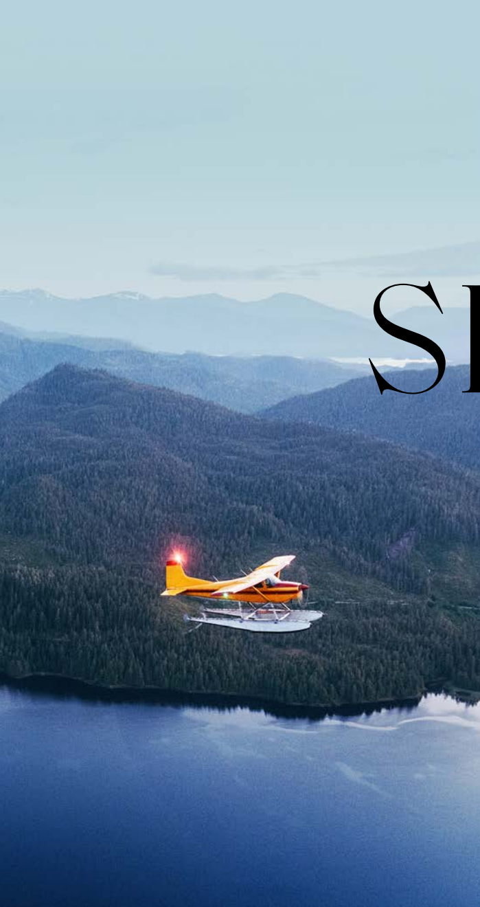
Seaplane tour of Seattle and Puget Sound