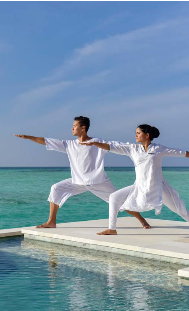
Private yoga session

Or embark on a turtle safari with our resort's resident marine biologist for an introduction to the lives of these beautiful creatures, visiting a nearby site where you can see the turtles up close.