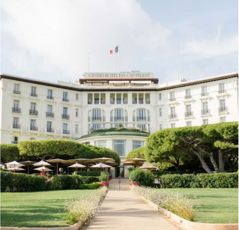
Grand-Hôtel du Cap-Ferrat

Departing from Monaco's glamorous Yacht Club, feel the wind in your hair and discover the splendours of the French Riviera from offshore as you cruise to the Cap-Ferrat harbour on an exhilarating speedboat ride.