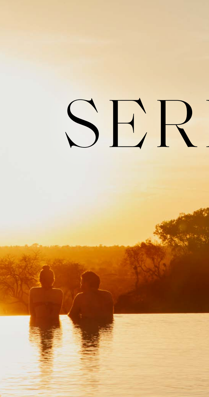
Infinity pool overlooking an elephant watering hole