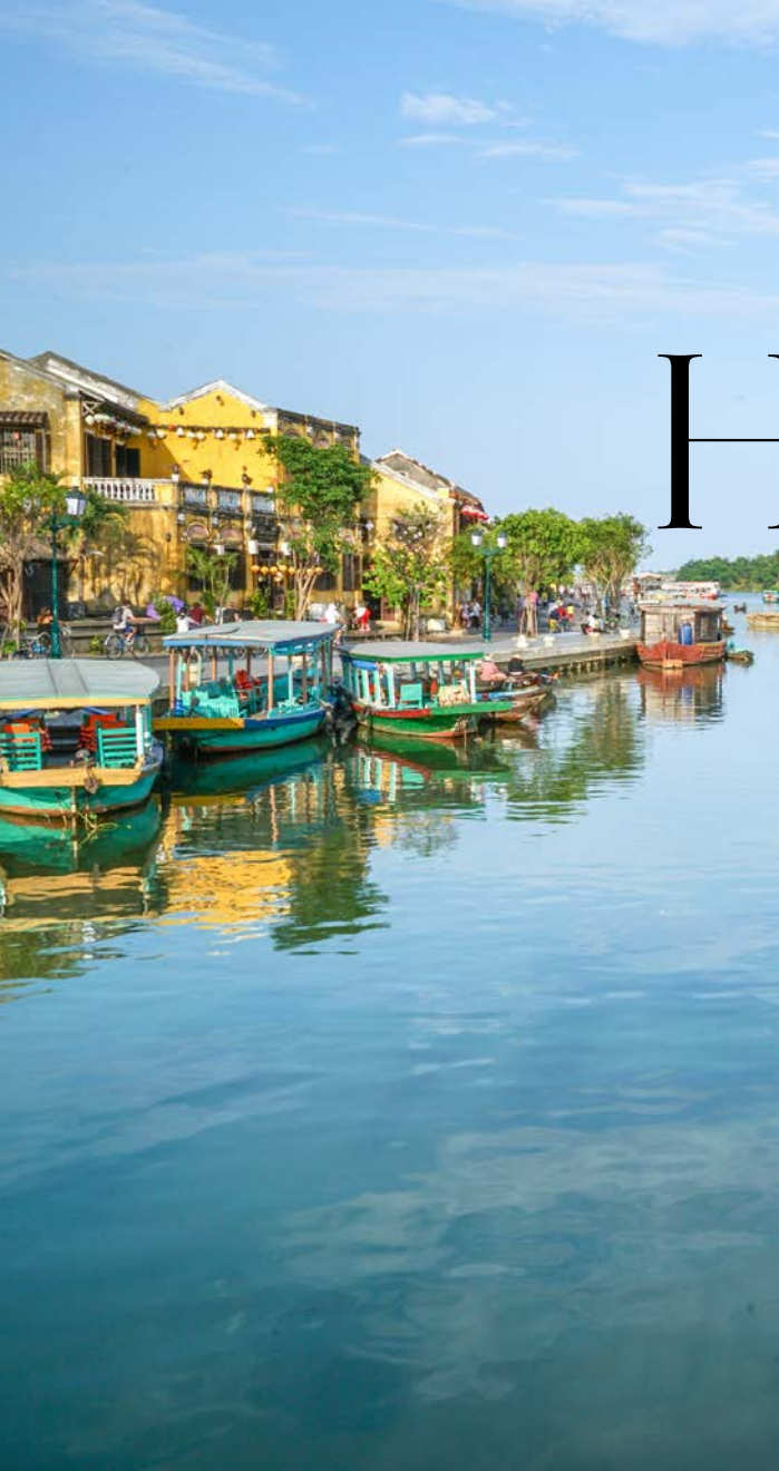
Thu Bon River, Old Town