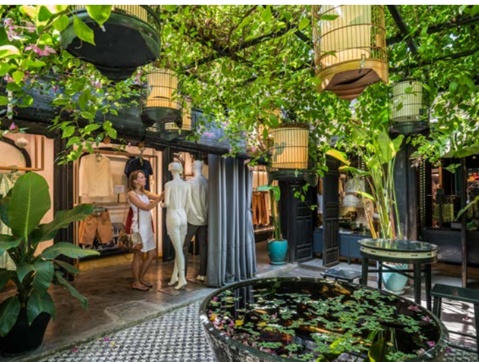
Visiting a local tailor