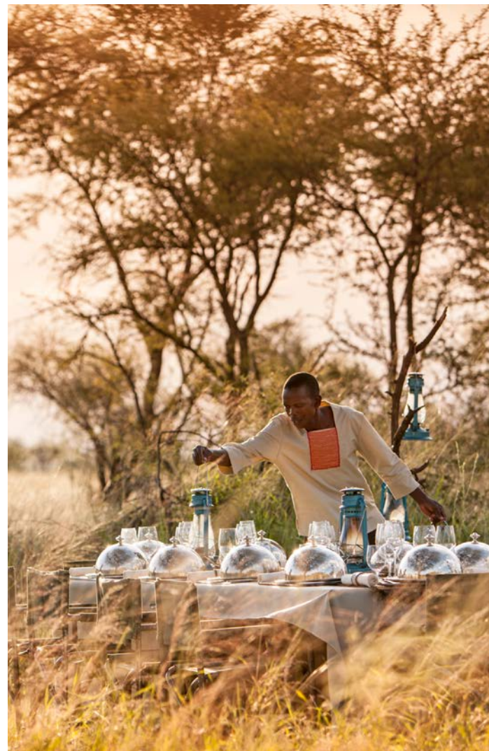
Bush dinner at Four Seasons Safari Lodge Serengeti

Our global network allows us to open doors to unique experiences, providing exclusive access in each destination. Our local experts and on-the-ground guides are ready to share their insider knowledge, and property concierges have recommendations to help you explore according to your personal travel style. Along the way, our journey team guides you seamlessly between your chosen activities, ensuring that all you need to do is enjoy the experiences in store.