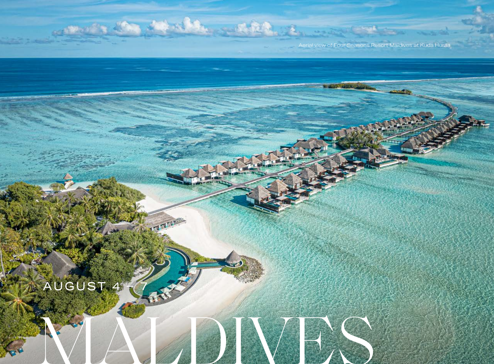
Aerial view of Four Seasons Resort Maldives at Kuda Huraa