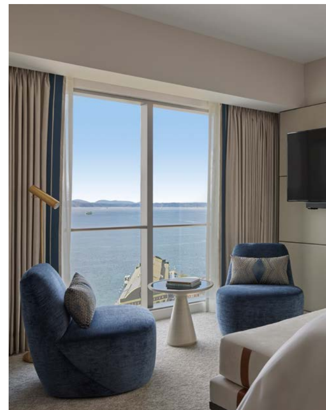
Dramatic Elliott Bay views from Four Seasons Hotel Seattle