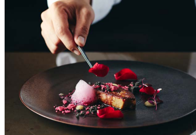
Exquisite dining experiences