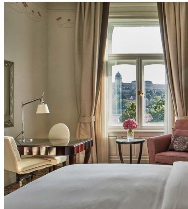
Four Seasons Hotel Gresham Palace Budapest