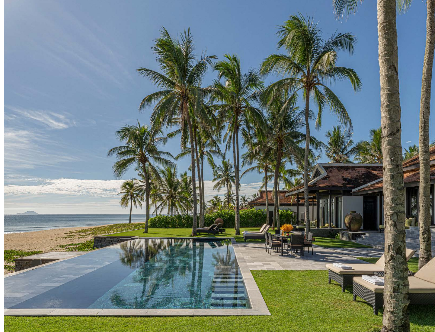
Four Seasons Resort The Nam Hai, Hoi An

Explore the Hoi An countryside, gaining special insight into everyday village life. Visit a local farmer's house, try your hand at regional farming techniques, and take a short bike ride to a small village nestled among seemingly endless rice fields. End with a traditional basket boat ride along the Thu Bon River, passing duck farms, fishermen and the Hoi An market on your way back to town.