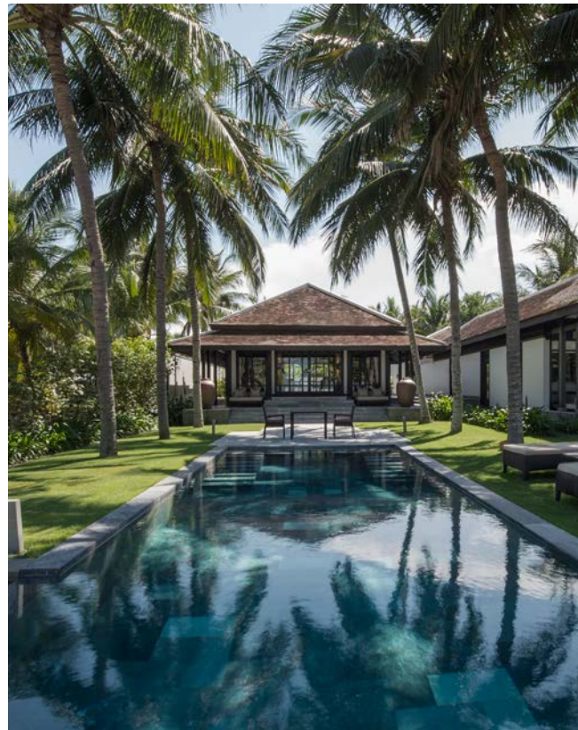
Four Seasons Resort The Nam Hai, Hoi An