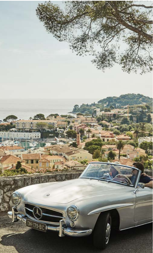
Vintage car ride to Monte-Carlo

Farewell doesn't have to mean goodbye—at least not yet. Opt to extend your journey to spend some time exploring the best of the French Riviera before embarking on your flight home.