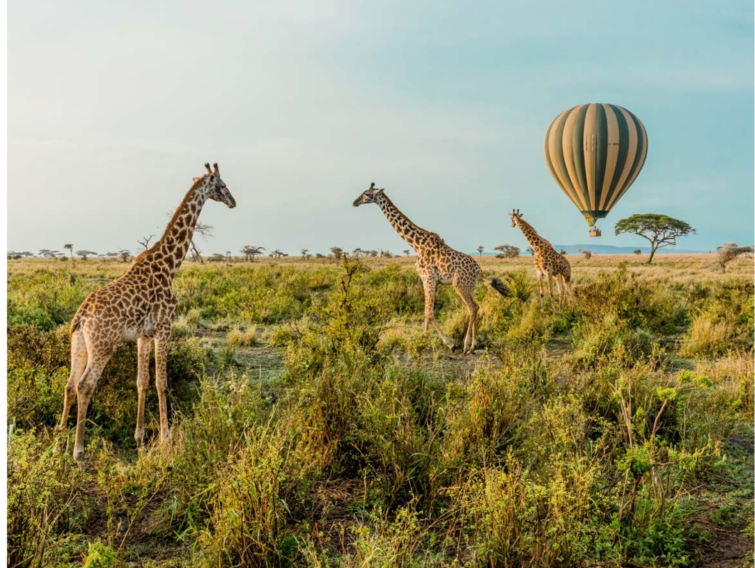
Hot-air balloon ride

Your journey through the world's most pristine landscapes continues in Serengeti National Park, where you are surrounded by the beauty of the land and its wild inhabitants. Your safari begins the moment you arrive, with a game drive to our lodge. Over the next three nights, choose from half-day or all-day game drives that bring you up close to Africa's largest and most diverse concentration of wildlife.