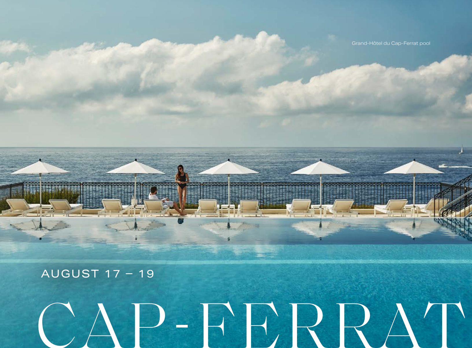
Grand-Hôtel du Cap-Ferrat pool