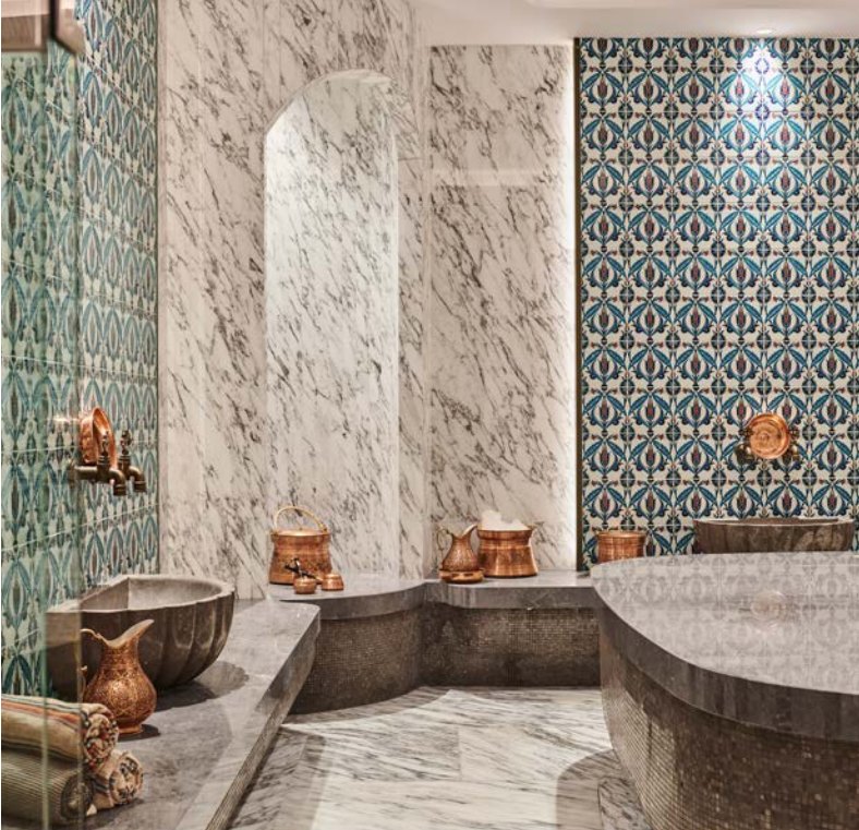
Four Seasons Hotel hammam

Witness the legacy of civilisations as you marvel at the opulence of the Topkapi Palace, admire the magnificently tiled Blue Mosque and gaze up into the hallowed dome of Hagia Sophia, a treasure of Byzantine and Ottoman architecture.