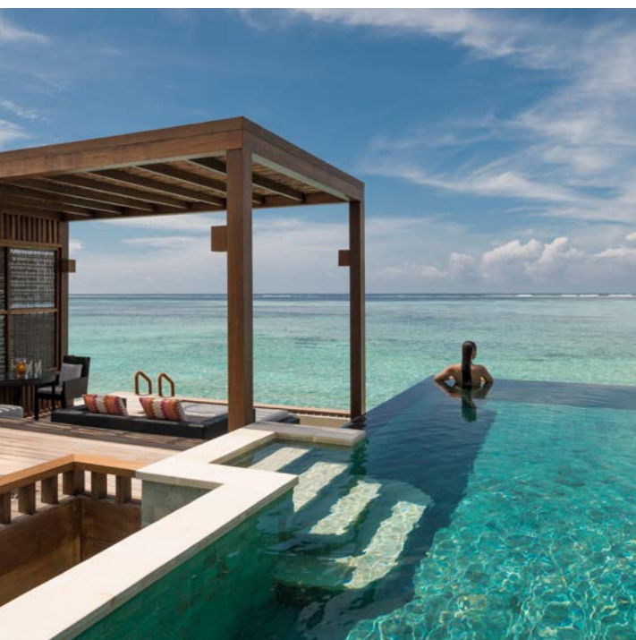
Plunge pool, Four Seasons Resort Maldives at Kuda Huraa