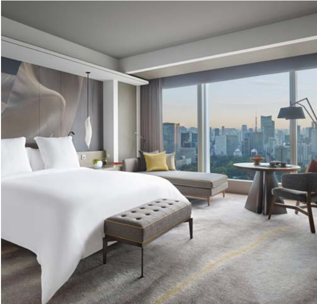
Sweeping city views from the room

Your adventure begins in Japan's eclectic metropolitan capital, a city of contrasts where ancient temples and age-old markets stand alongside modern high-rises and a sparkling skyline.