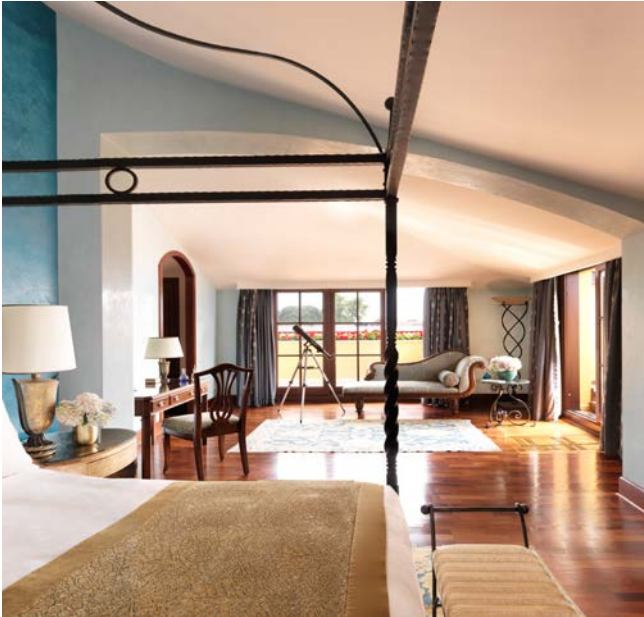
Four Seasons Hotel Istanbul at Sultanahmet

One of the world's most legendary cities, Istanbul is a millennia-old link between East and West. Encounter the architecture of empires past in a dazzling cityscape where soaring Byzantine churches stand alongside Ottoman mosques and Roman ruins.